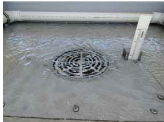
Surcharged Flow – 3 L/s (20mm)