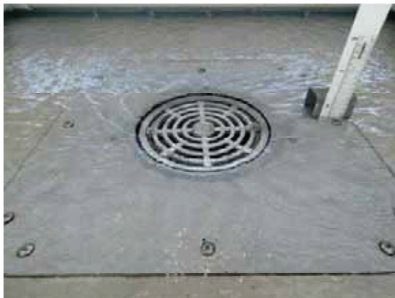
Weir Flow – 1.5 L/s (8mm)