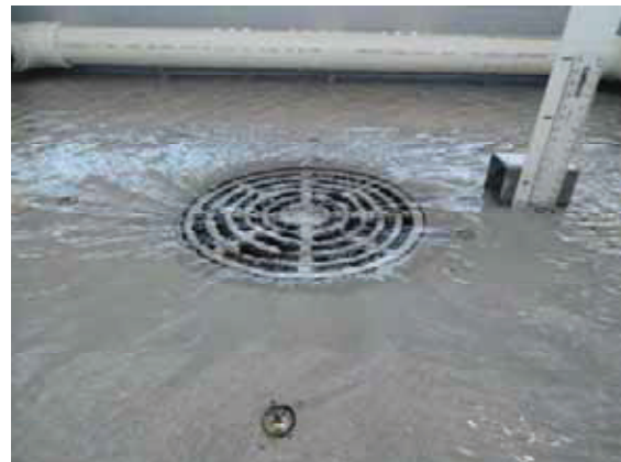
Surcharged Flow – 3 L/s (22mm)