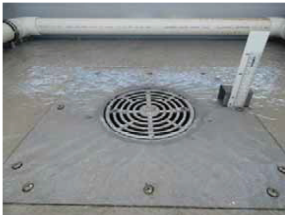
Weir Flow – 1.5 L/s (6mm)