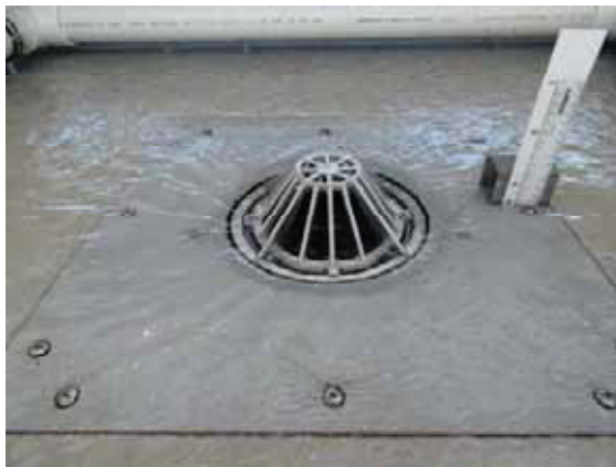
Weir Flow – 1.5 L/s (7mm)