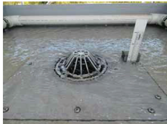
Surcharged Flow 3 L/s (20mm)