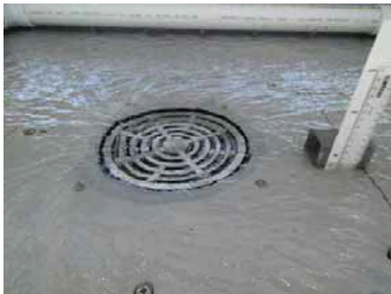
Weir Flow 6 L/s (30mm)