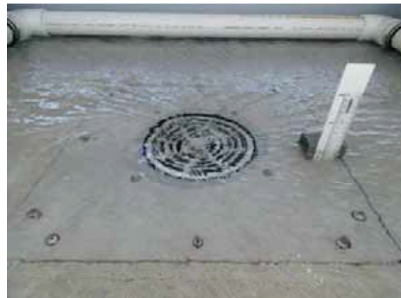
Surcharged Flow 10 L/s (40mm)