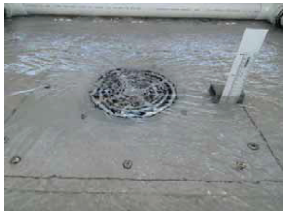
Orifice flow 10 L/s (40mm)