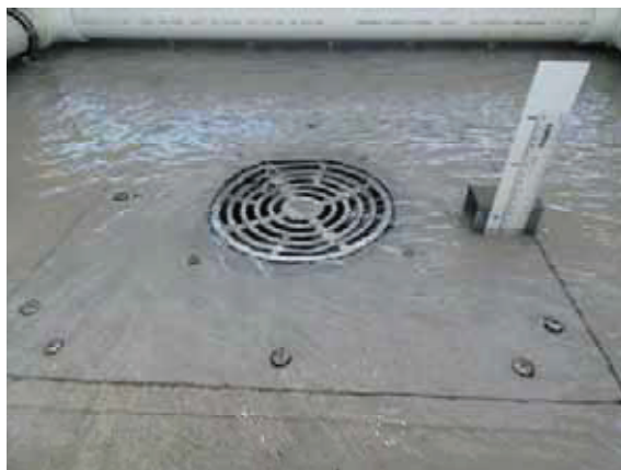
Weir Flow 6.0 L/s (35mm)