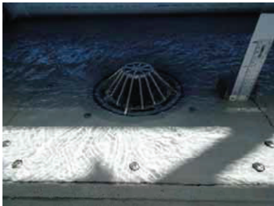
Weir Flow – 8 L/s (30mm)