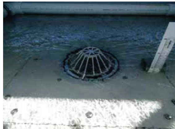
Surcharged Flow – 12 L/s (40mm)