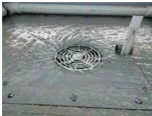
Weir Flow – 7 L/s (30mm)