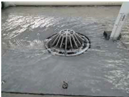
Weir Flow 8 L/s (37mm)