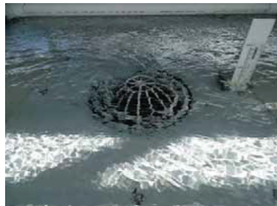
Surcharged Flow >12 L/s