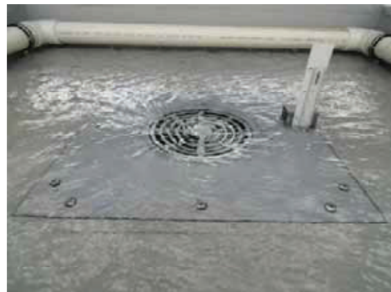
Surcharged flow – 4 L/s (20mm)