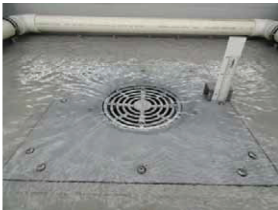
Weir Flow – 3 L/s (15mm)