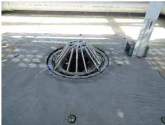
Weir Flow – 3 L/s (12mm)