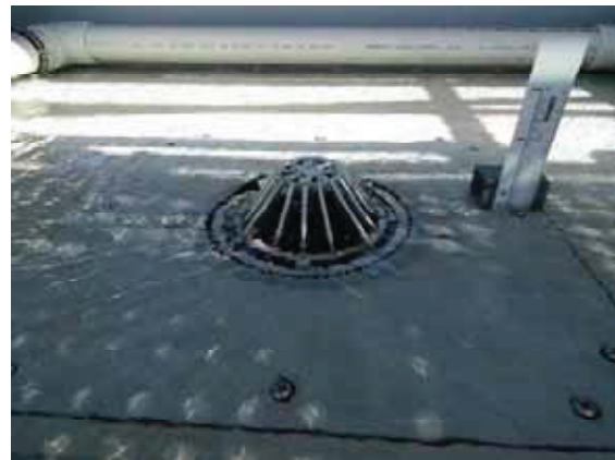
Surcharged flow 5 L/s (30mm)