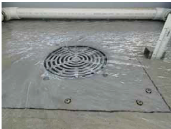
Weir Flow – 7 L/s (25mm)