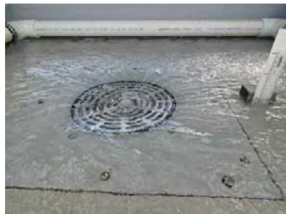
Surcharged Flow – 12 L/s (40mm)