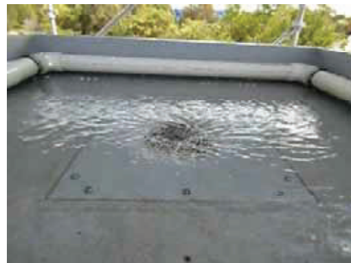
Surcharged flow – 3 L/s (30mm)