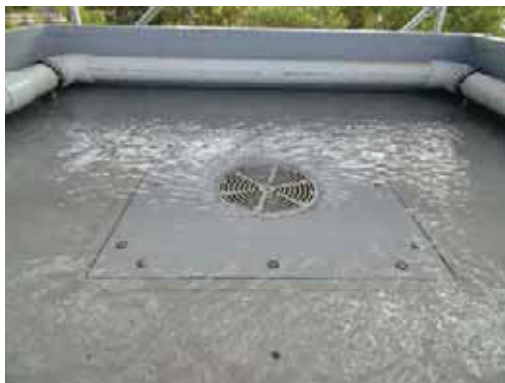
Weir flow - 1 L/s (10mm)