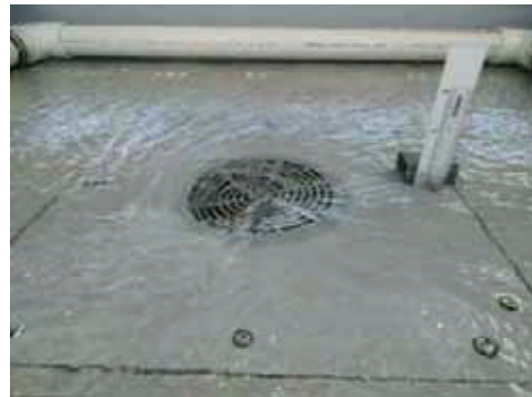
Surcharged flow – 4 L/s (30mm)