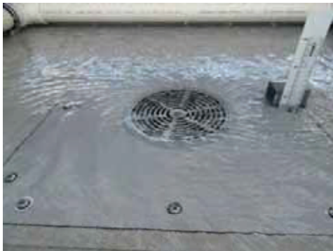
Weir Flow – 2.5 L/s (15mm)