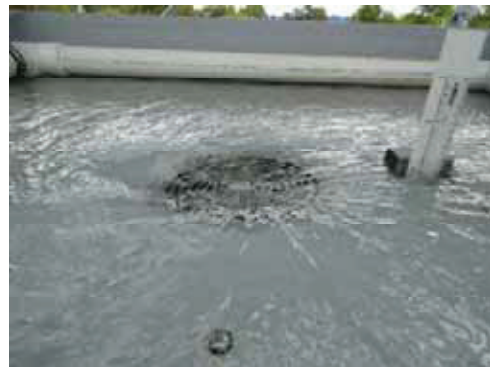
Surcharged Flow – 6 L/s (40mm)