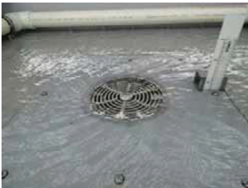
Weir Flow – 2.5 L/s (20mm)