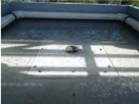
Weir flow - 1 L/s (40mm)