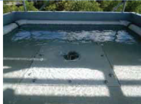
Orifice Flow - 3.0 L/s (80mm)