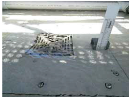
Surcharged Flow – 10 L/s (40mm)