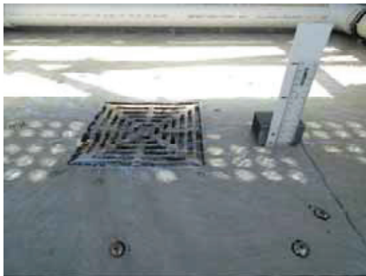
Weir Flow – 6 L/s (18mm)