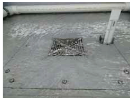
Surcharged Flow 4 L/s (27mm)