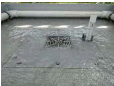
Weir Flow – 2 L/s (20mm)