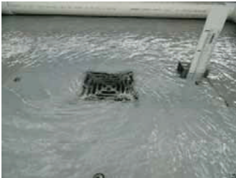
Weir flow - 2 L/s (35mm)