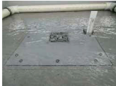
Surcharged flow - 3 L/s (40mm)