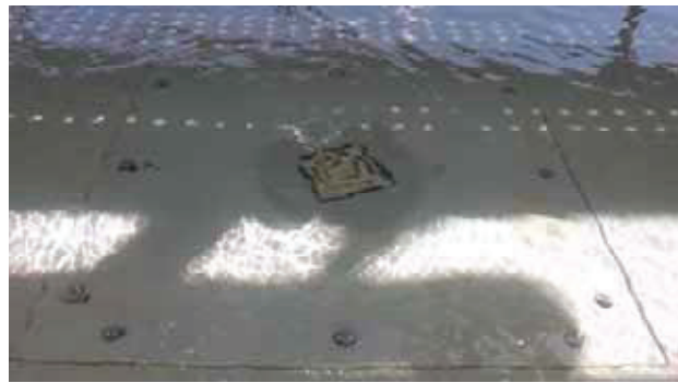
Surcharged Flow - 2.5 L/s (110mm)