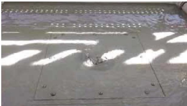
Weir flow - 1 L/s (50mm)