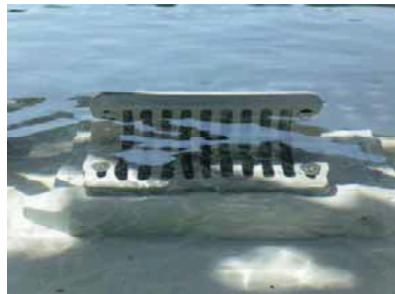
Surcharged Flow – 3.5 L/s (120mm)