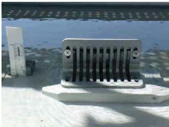
Weir Flow – 2 L/s (50mm)