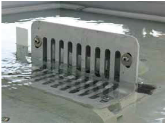
Weir Flow – 4.0 L/s (80mm)